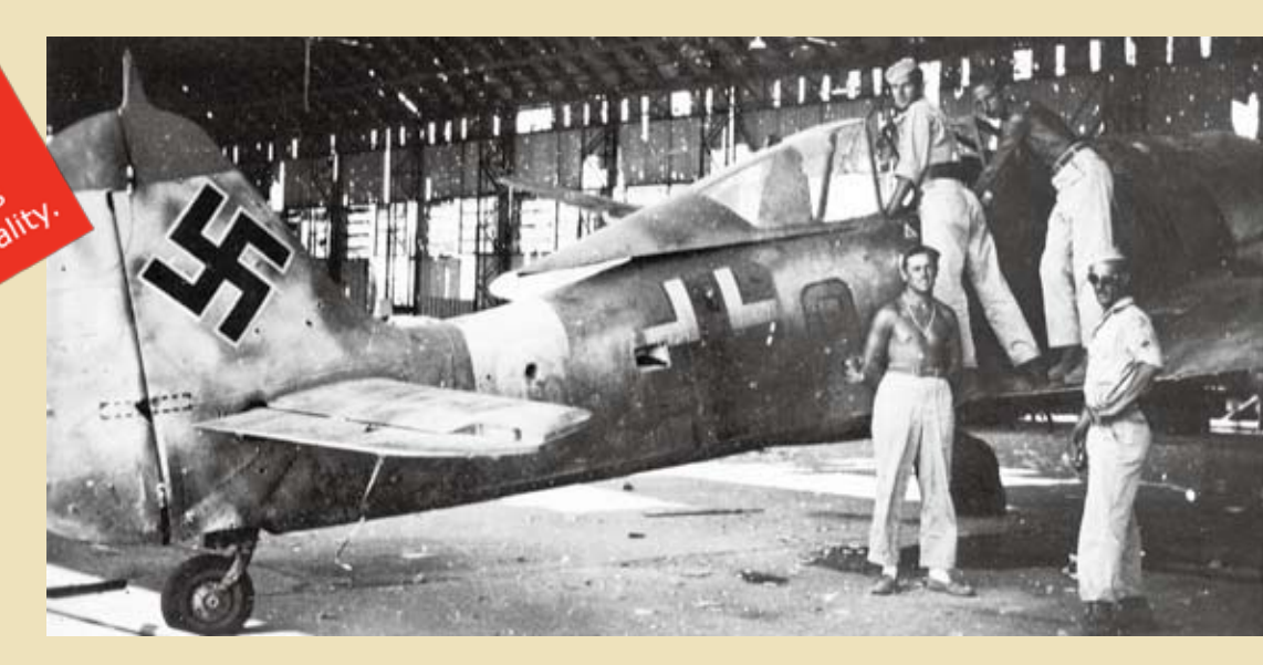
Top: Crashed Fw 190 A-4 W.Nr 0142 409 'Black 2 + <-' of 10.(Jabo)/JG 26, which was shot down over England on 20 January 1943. This aircraft had the top of its tail painted yellow. The pilot, Lt. Hermann Hoch, was taken prisoner. (via Watkins and Goss)

Centre and bottom: Two Mediterranean examples of the tops of tails painted yellow. (Zirus and Crow)